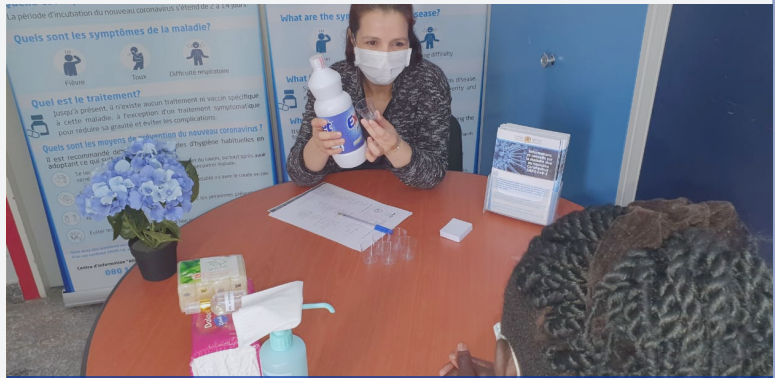
Sensitization session during humanitarian assistance in Rabat with ALCS

Number of migrants provided assistance through IOM interventions from 1 Jan- 31 Mar 2020.